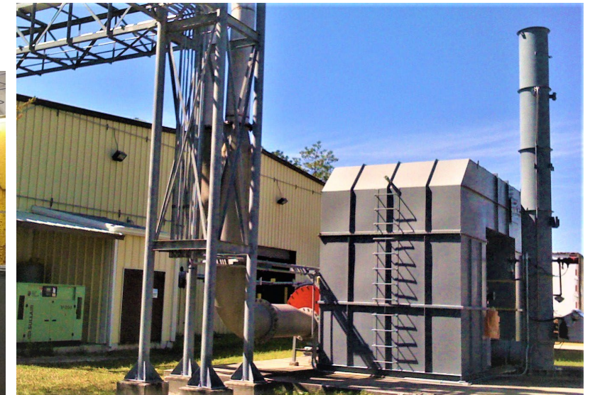
THERMAL DESORBER (MR-15EX)